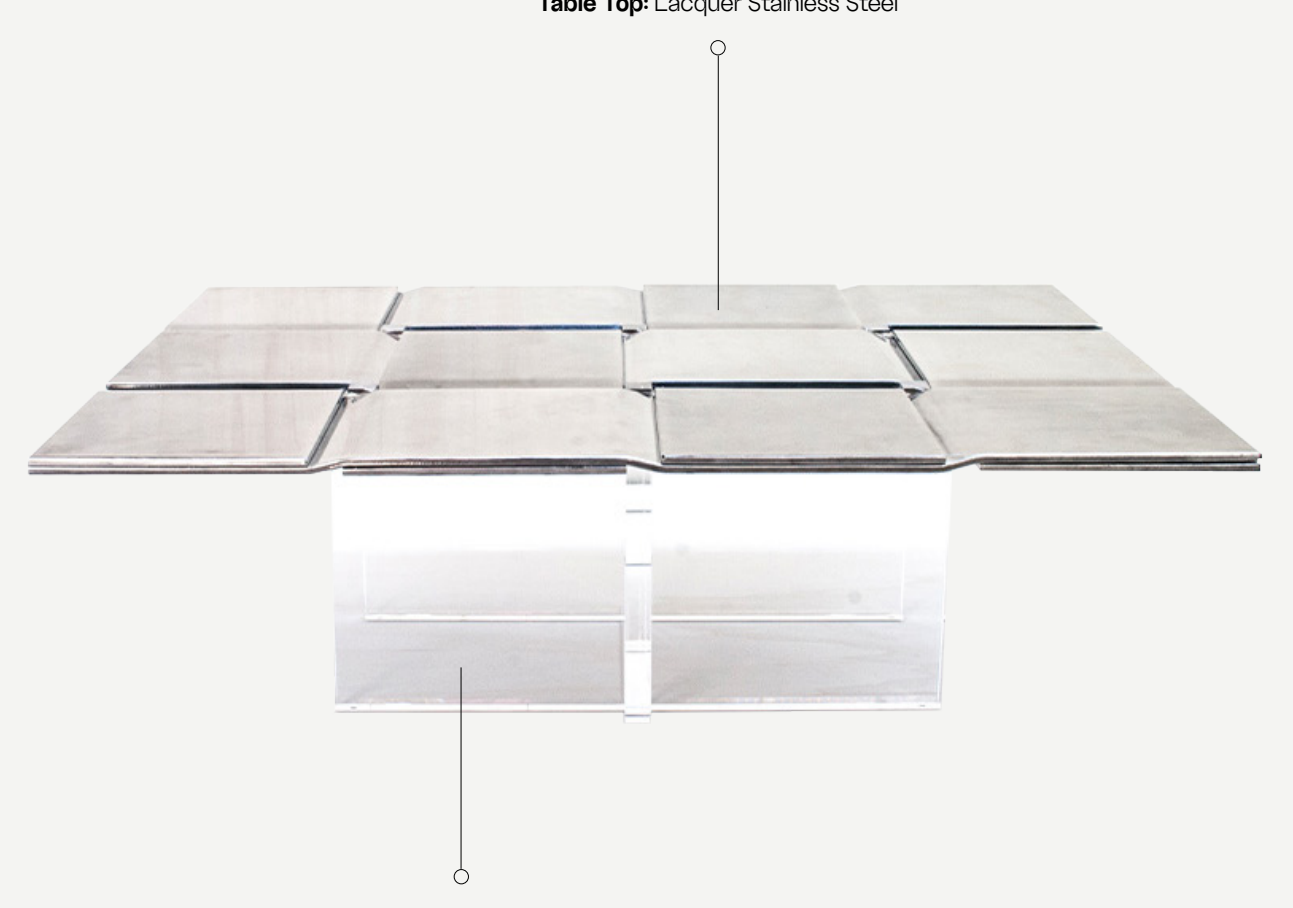
Table Top: Lacquer Stainless Steel